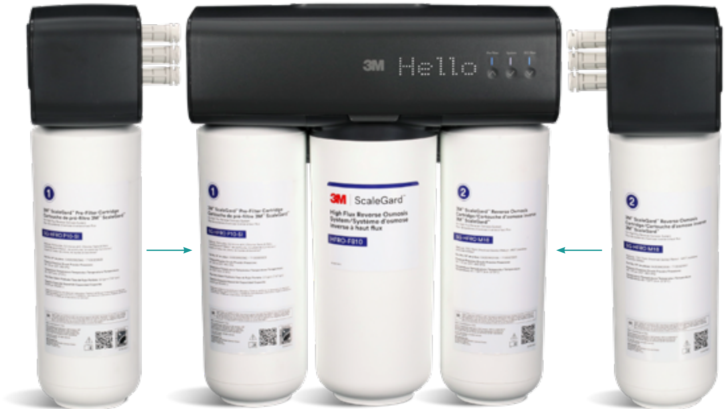
PRE-FILTER EXPANSION SET

Throughout your operation, the 3M™ ScaleGard™ High Flux Reverse Osmosis System is engineered to evolve with your changing water quality and capacity demands.