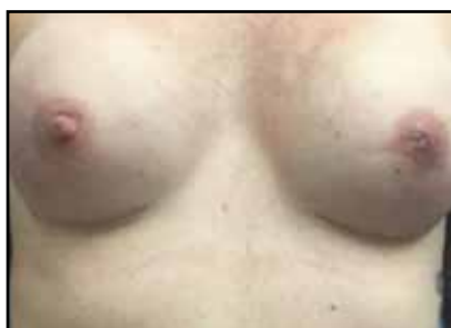
Figure 6. POD 65, incisions were completely healed, and both nipples were viable.

Photos and patient information courtesy of Dr. Regina M. Fearmonti, Alon Aesthetics/Fearmonti Plastic Surgery.