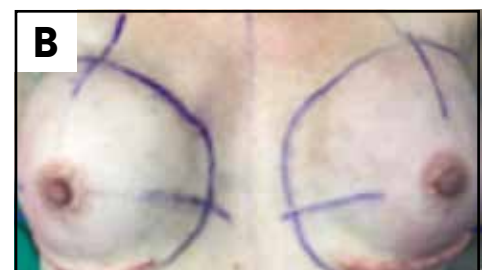
Figure 2. Bilateral, nipple-areolar-sparing mastectomy. A. Two surgical incisions at the inframammary folds resultant of bilateral mastectomy. B. Closure of bilateral incisions via subcuticular suturing.