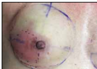
Figure 5. On POD 7, erythema was noted bilaterally on the reconstructed breasts after removal of Prevena Restor™ Bella•Form™ Dressing.