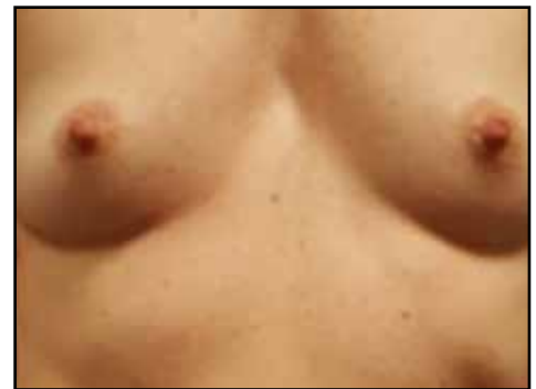
Figure 1. Patient at presentation after diagnosis of invasive ductal carcinoma of the right breast.

On postoperative day (POD) 6, the patient returned to the clinic for a follow-up visit ( Figure 4A ). The Prevena Restor™ Bella•Form™ Incision Management System was removed to evaluate the reconstructed breasts, tissue integrity, and the incisions ( Figure 4B ). Upon dressing removal, some skin wrinkling was noted, which was temporary and did not cause any skin breakdown. Following the evaluation, the Prevena Restor™ Bella•Form™ Incision Management System was reapplied to manage the incision, reduce tensile force across the closed incision and to help hold the edges of the closed incision together. On POD 7, the patient returned to the clinic and the dressing was removed due to loss of seal as the patient was diaphoretic during the evening. Although erythema was present, this was not caused by the dressing ( Figure 5 ). The patient was transitioned to a cotton brassiere with no pressure as well as prescribed topical silver sulfadiazine (Silvadene® Cream, Pfizer Inc., New York, NY) and oral ciprofloxacin. The drains were removed after 10 days. At POD 65, the incisions were completely healed, and both nipples were viable ( Figure 6 ).