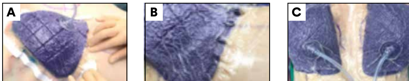
Figure 3. Application of 3M™ Prevena Restor™ Bella•Form™ Incision Management System. A. Placement of 3M™ Prevena Restor™ Bella•Form™ Dressing (21cm x 19cm) along the inframammary fold and mastectomy flap incisions. B. Dressing placement did not obstruct drains. C. The initiation of 3M™ Prevena Restor™ Therapy (-125mmHg) to the closed incisions.

In this case, the 3M™ Prevena Restor™ Bella•Form™ Incision Management System managed the incisions, helped hold the edges of the incision together, bolstered the mastectomy flap, and helped reduce skin oedema. Nipple viability was maintained.