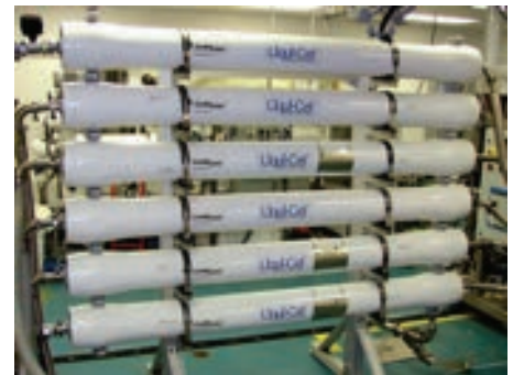
Figure 2. 3M™ Liqui-Cel™ EXF-8×80 Series Membrane Contactor System

Now, however, there is increasing discussion and activity around using membrane contactor technology to remove dissolved gases from water in many hydrocarbon related applications. High-pressure 3M™ Liqui-Cel™ EXF-8×40 and EXF-8×80 Series Membrane Contactors use a much smaller footprint and weigh far less than deaeration towers – and they do not require chemicals to operate.