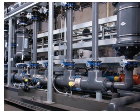
Figure 3. 3M™ Liqui-Cel™ EXF-14x40 Series Membrane Contactor in CSG Pilot Degassing System

To meet the water quality standards for re-injection, a water treatment system was built that would include filtration, RO, UV and Liqui-Cel membrane contactors, which are used to deoxygenate the produced water before re-injection. Dissolved O 2 concentration levels at the water treatment system outlet should be lower than the dissolved oxygen concentration levels of the formation water.