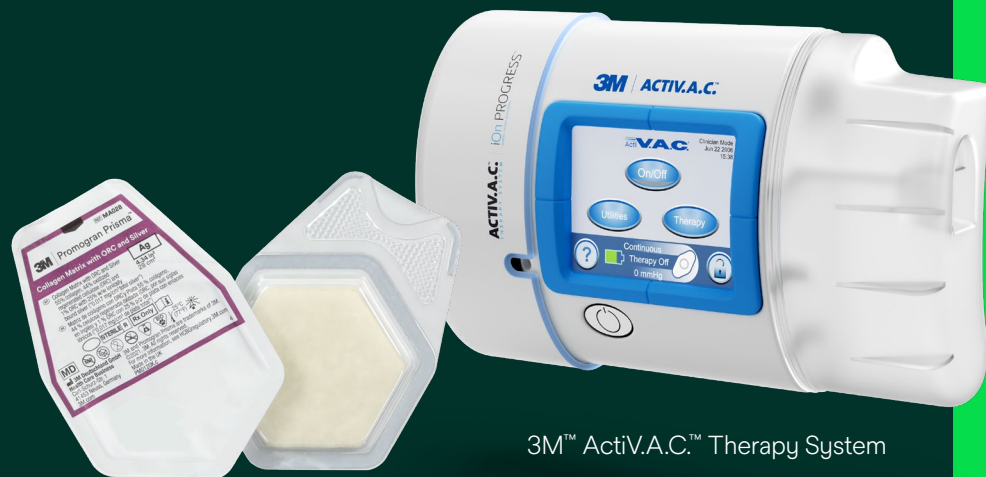
3M™ Promogran Prisma™ Collagen Matrix with ORC and Silver