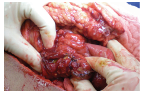
B. Damage control surgery for massive bowel edema.