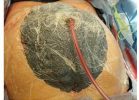
E. AbThera Therapy was used for 9 days.