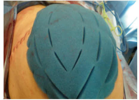
D. The Solventum™ AbThera™ Perforated Foam was measured and cut to fit inside the exposed abdominal cavity.

Solventum™ AbThera™ SensaT.R.A.C.™ Open Abdomen Dressing and Solventum™ AbThera™ Advance Open Abdomen Dressing are designed for use with the negative pressure wound therapy provided by the Solventum™ V.A.C.® Ulta™ Therapy Unit. When using the V.A.C.® Ulta™ Therapy Unit, do not select the Solventum™ Veraflo™ Therapy option. See Instructions for Use.