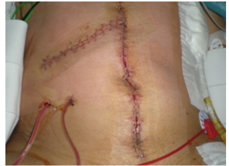
F. Definitive closure on Day 9.