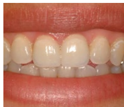
Fig. 11: Restorations one week after cementation.