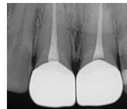
Fig. 12: Radiographs indicating no residual cement and tight fitting restorations with no gaps at the margins.