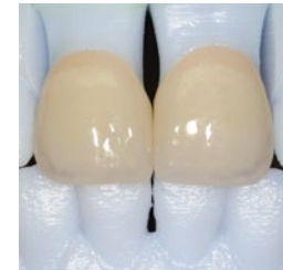
Fig. 6: Finished restorations on digitally printed model.