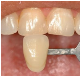
Fig. 2: Determine shade.