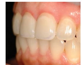
Fig. 14: Lateral view after one week.

Before using the products described, please refer to the instructions for use provided with the product packages.