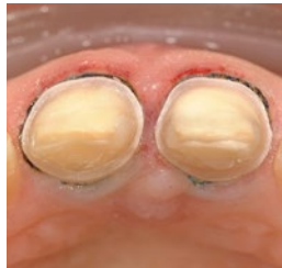
Fig. 3: Prepared teeth with chamfer margin and supragingival margin.