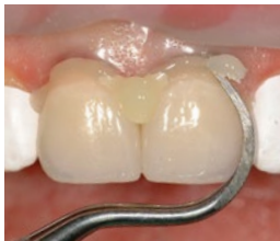
Fig. 9: Seat crowns but do not wipe and smear the cement. Tack cure cement for ~ 2 s and cement will be easy to remove. Then fully light cure for 20s on each surface.