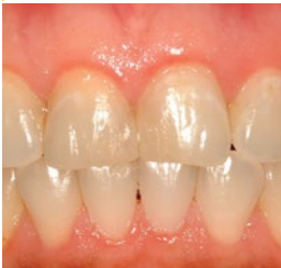
Fig. 1: Patient requested better-looking shape and appearance on 8 and 9.