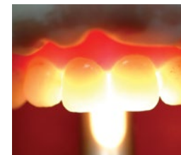
Fig. 13: Lava Esthetic restorations in transmitted light showing the excellent translucency.