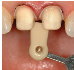
Fig. 4: IMPORTANT: communicate preparation shade.