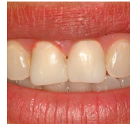
Fig. 5: Temporized teeth after sending digital scan to the lab.