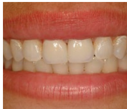
Fig. 10: Restorations immediately after cementation and clean-up.