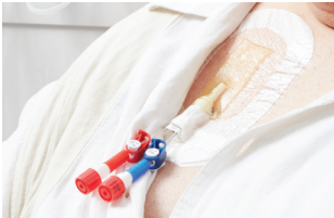
Großlumige Gefäßzugänge/ Dialysekatheter